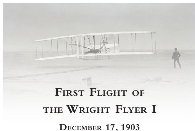
Orville Wright piloting, Wilbur Wright running at wingtip